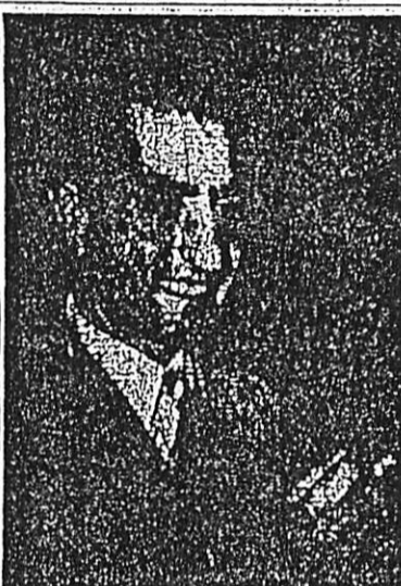
Iran's violent revolution may halt threat of Red drive for power

Vishinsky also accused the United States of "barrenness" in its stand against peace in the Korean peninsula. He said that the United States was "barren" because it was based on the demand for the complete withdrawal of North Korean forces from the Korean peninsula.