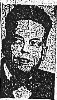
Dr. Alfred C. Kinsey Explodes S-bomb