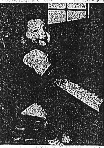
Failure to join in group is not necessarily a fault. Child can express individuality and be normal.

FRESH FRUIT MELANGE. Have fruit chilled. Blend peaches and lemon juice. Blend gently. When waffles are done, place one on plate and cover with half the dressing. Place second waffle on top and cover with peaches. Combine whipped cream, remaining lemon rind and two tablespoons sugar. Spoon over top of peaches. Sprinkle cream with nutmeg. If desired, visit four servings.